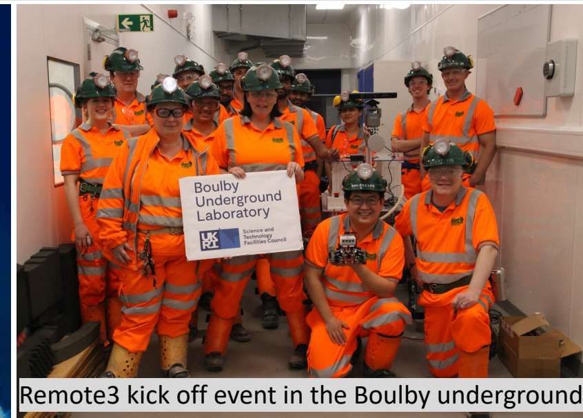
Remote3 kick off event in the Boulby underground