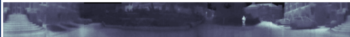
Fig 2. Panoramic image captured on MA-TIR System (for VR video scan QR Code)