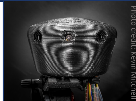
Fig 1. Image of MA-TIR System

Extreme field-of-views are unavailable in the long-wave infrared. The MA-TIR imaging system provides panoramic 360° imaging using low-cost off-the-shelf components. The scalable system architecture allows for arbitrary pixel resolution with a maximum pixel count proportional to the number of cameras integrated into the imaging architecture [1]. When combined with integral imaging and stereo vision, passive ranging and imaging occluded objects is achieved providing enhanced situational awareness. Furthermore the complementarity of integrating single photon avalanche diode (SPAD) with the MA-TIR imaging system can further interrogate a 3-D scene through TCSPC LIDAR. Recent results have detected breathing in a cluttered scene.